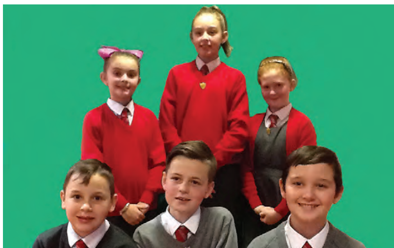
Shining Lights 2017 - 2018